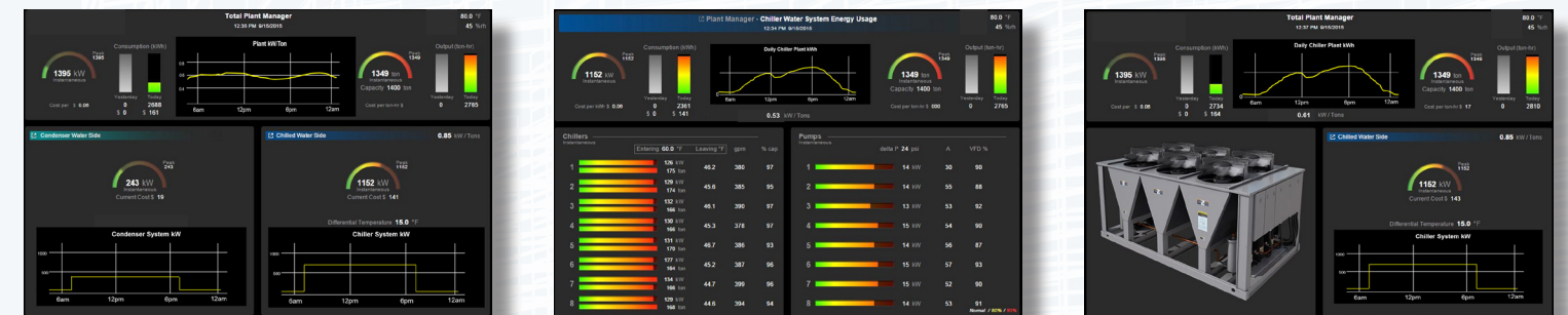
The graphic elements of the Carrier ChillerVu system's energy dashboards may be easily modified to match your specific HVAC system components... regardless of chiller plant size.