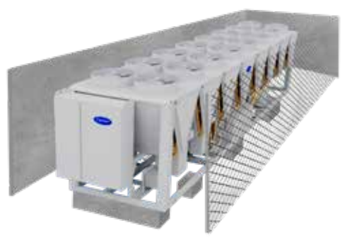
A chiller between chain-link and solid walls