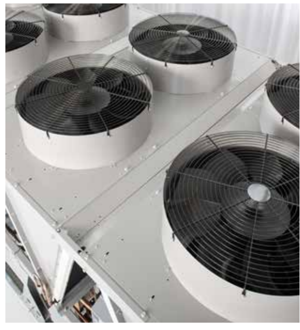
QUIET BY DESIGN

For applications that require the unit to quickly recover after a power supply interruption, the 30XV has you covered. Plus, it's more than a quick restart. The 30XV is able to recover to its full cooling capacity within four minutes after the interruption.