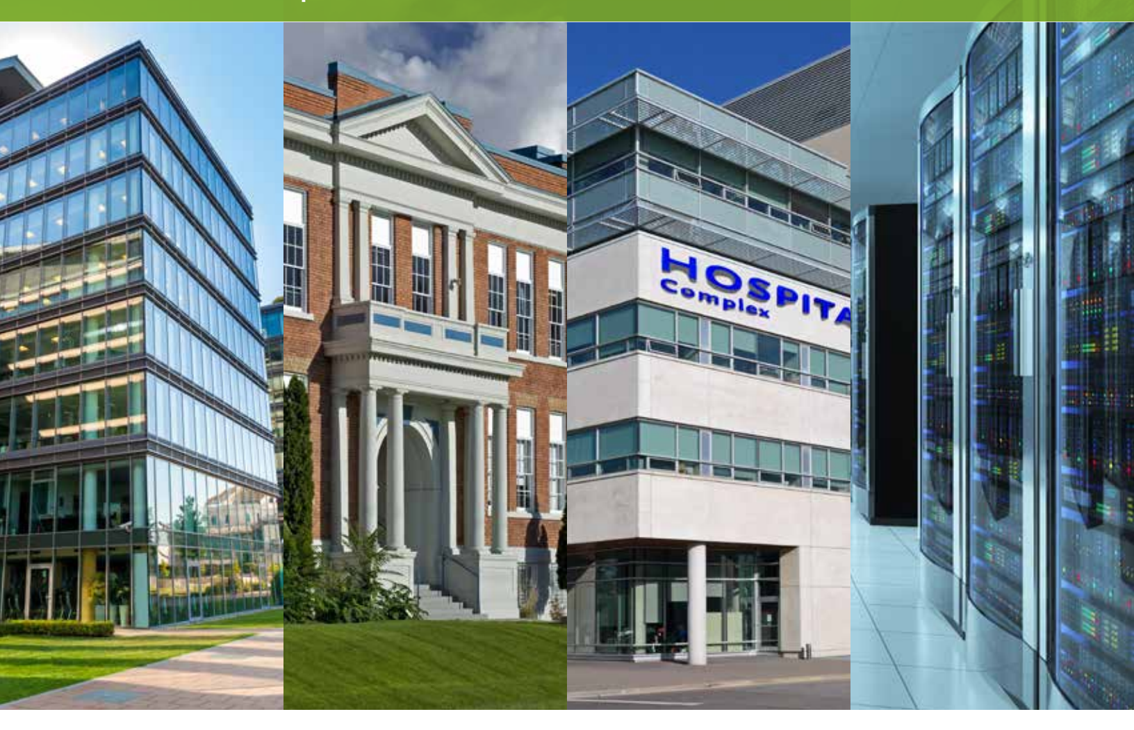
Designed for tomorrow. Expert fit for today.