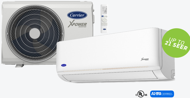
CARRIER INVERTER VS LOW SEER TRADITIONAL SYSTEM